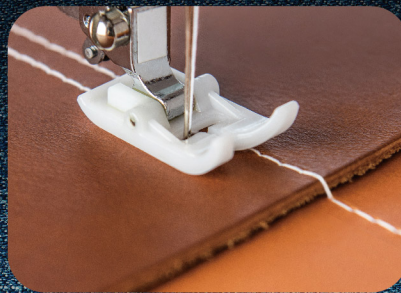
DC Motor Powerful & Stronger Stitching