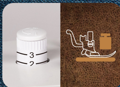
Adjustable Presser Foot Pressure