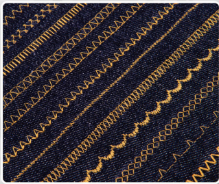
35 Built-in Stitches