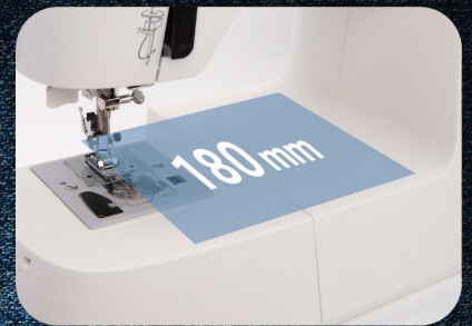
180 mm Wide Working Space